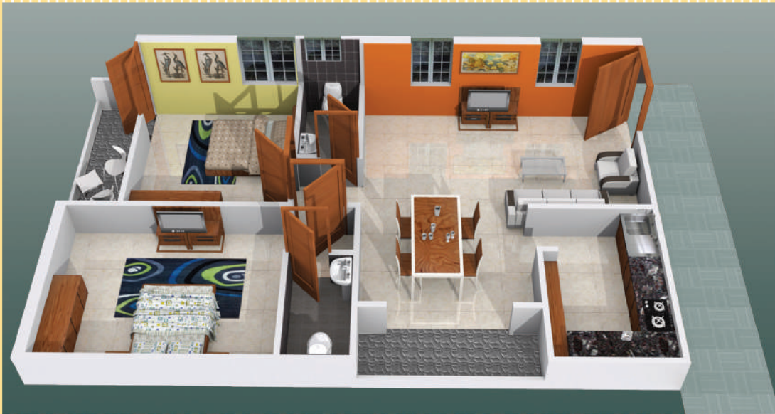
East facing Flat No. 6