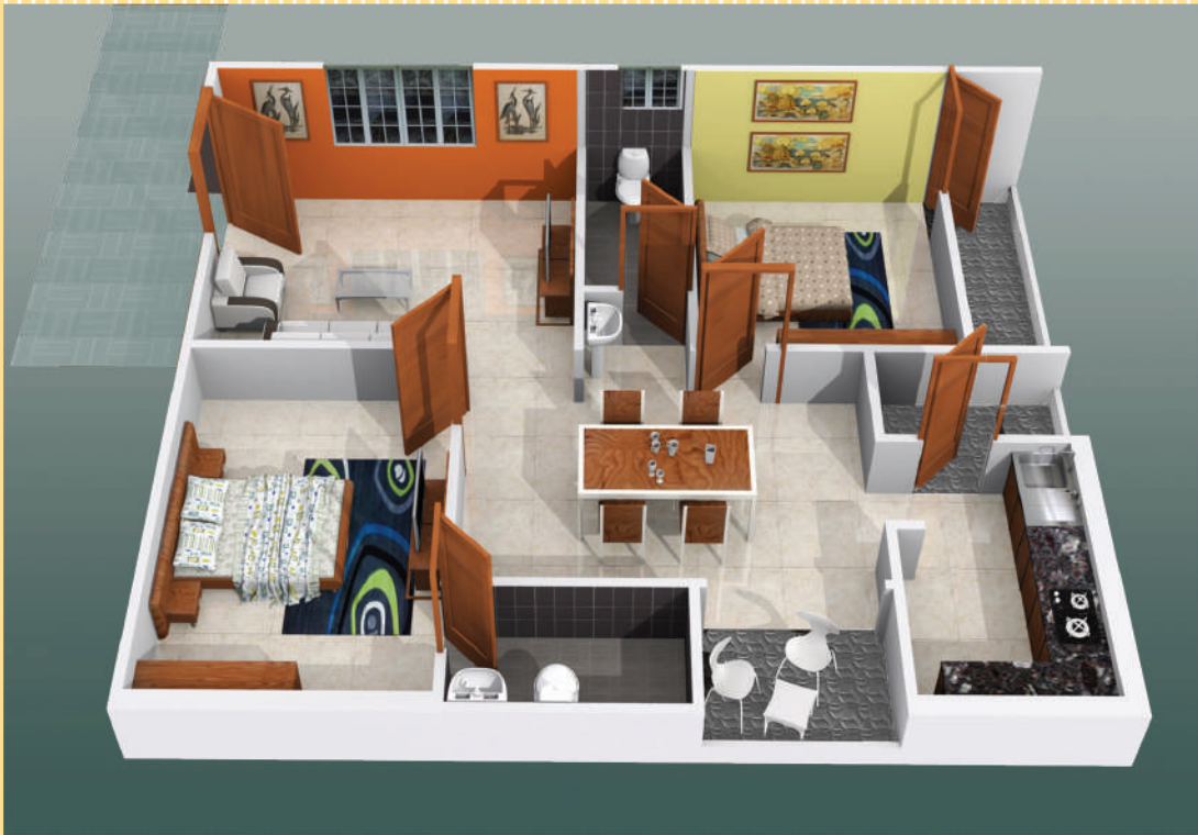
West facing Flat No. 3