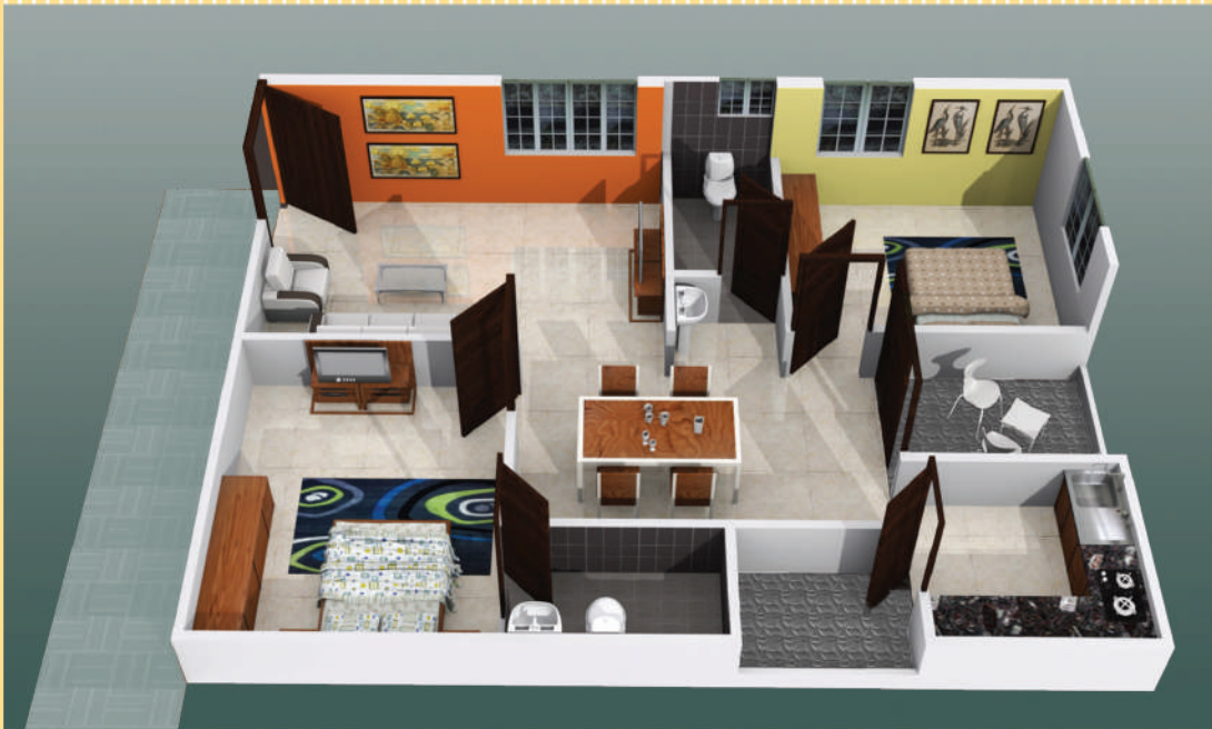
West facing Flat No. 1